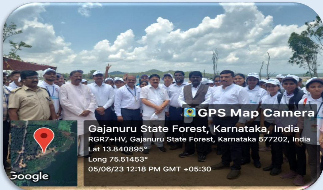
Students and Staff with Guests in World Environment Day Function at Elephant Camp, Sakkare Bailu, Shivamogga on 05/06/2023