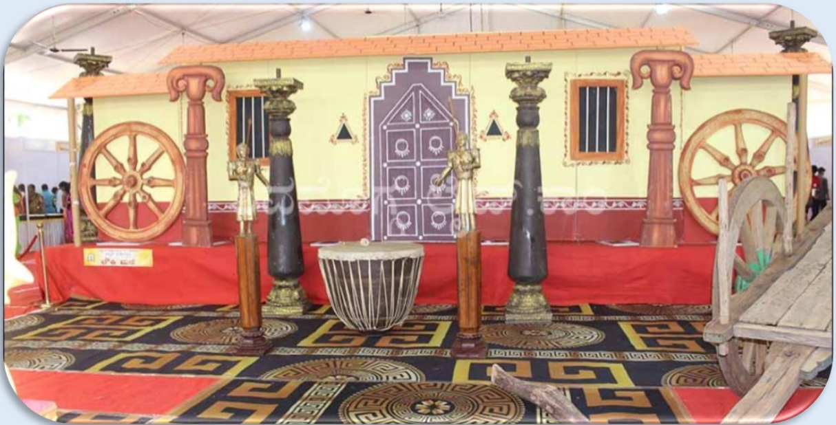
Chowki Mane in Malenadu Vaibava Stall @ NES Amrutha Mahotsava, NES Ground Shivamogga on 20-21, June,02023