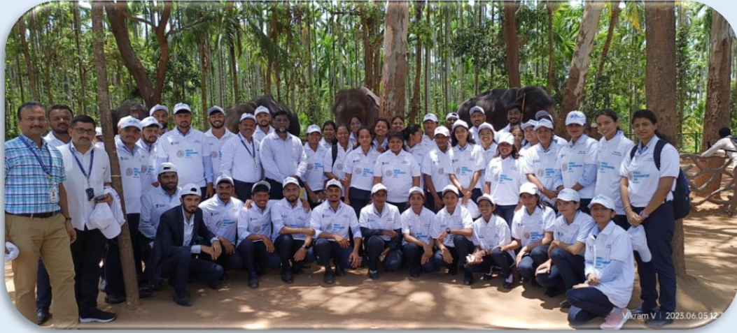
Students and Staff in World Environment Day Function at Elephant Camp, Sakkare Bailu, Shivamogga on 05/06/2023