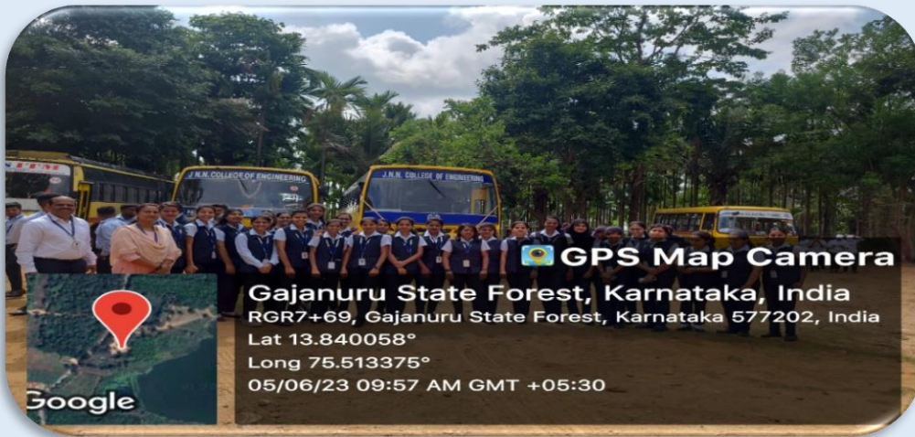
Students and Staff in World Environment Day Function at Elephant Camp, Sakkare Bailu, Shivamogga on 05/06/2023