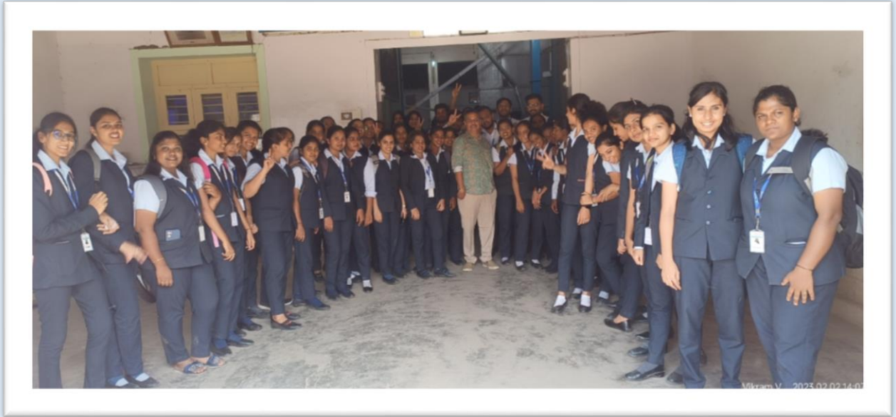
Students observing the Final packed rice bag, being loaded to truck on 02/02/2023