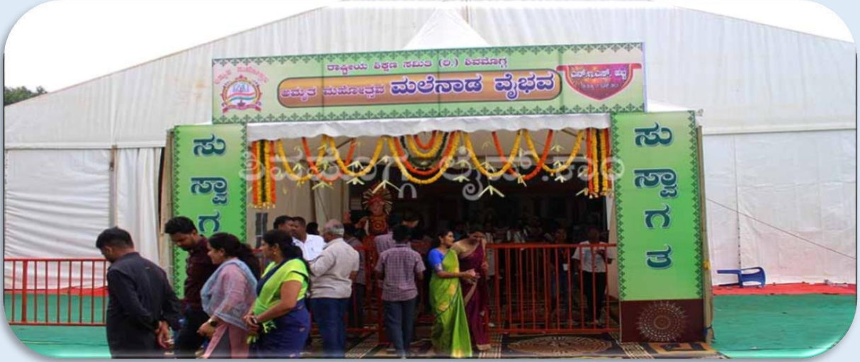
Entrance of Malenadu Vaibava Stall @ NES Amrutha Mahotsava, NES Ground Shivamogga on 20-21, June,02023