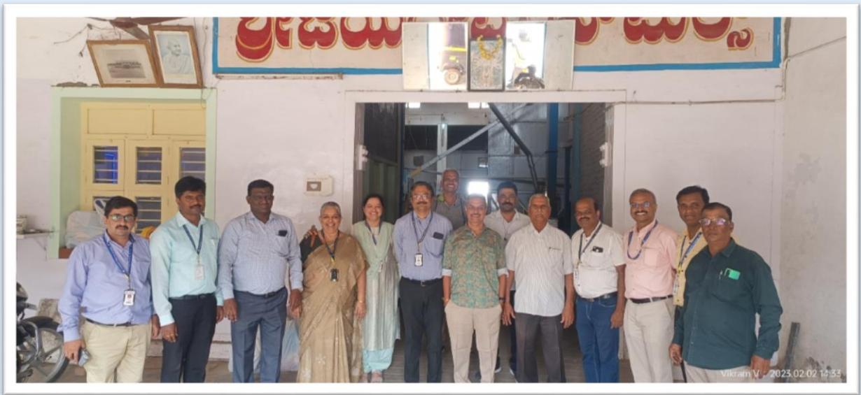
Faculty and Staff of Jaydeva Rice Mill during the industrial Visit On 02/02/2023