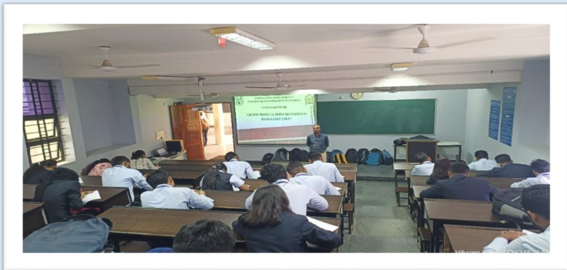
Students taking part in Essay Competition on “National Education Policy – Hopes & Effective Implementation” on 14 th & 15 th of December 2022