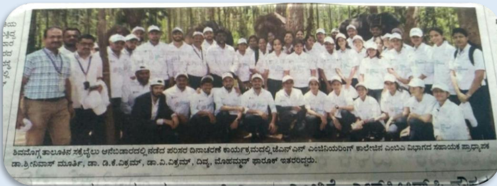
News paper cutting of World Environment Day Function at Elephant Camp, Sakkare Bailu, Shivamogga on 05/06/2023