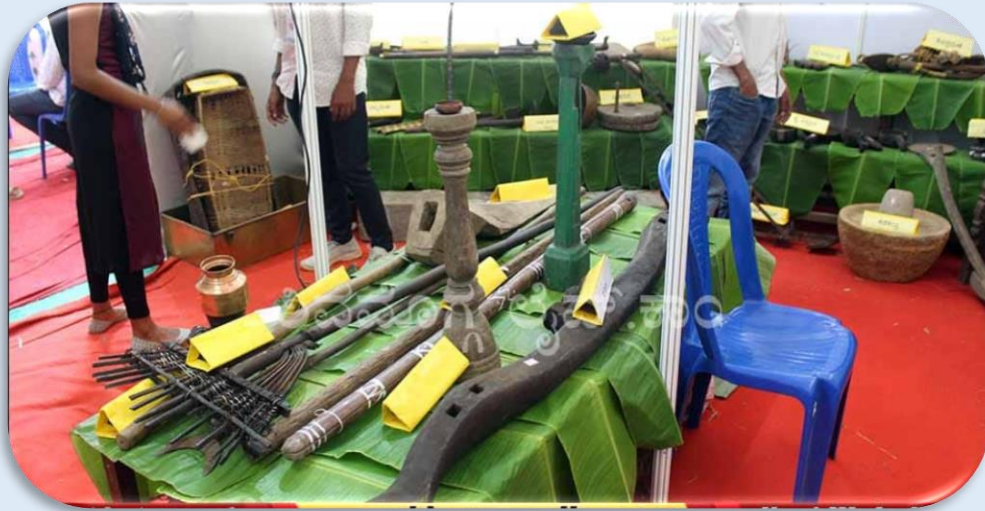
Exhibition of Malenadu lifestyle in Malenadu Vaibava Stall @ NES Amrutha Mahotsava, NES Ground Shivamogga on 20-21, June, 2023