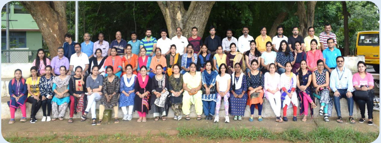
Two-Week FDP on “Paradigm Shift in Higher Education Teaching: Vision 2030” 8-19 July, 2019