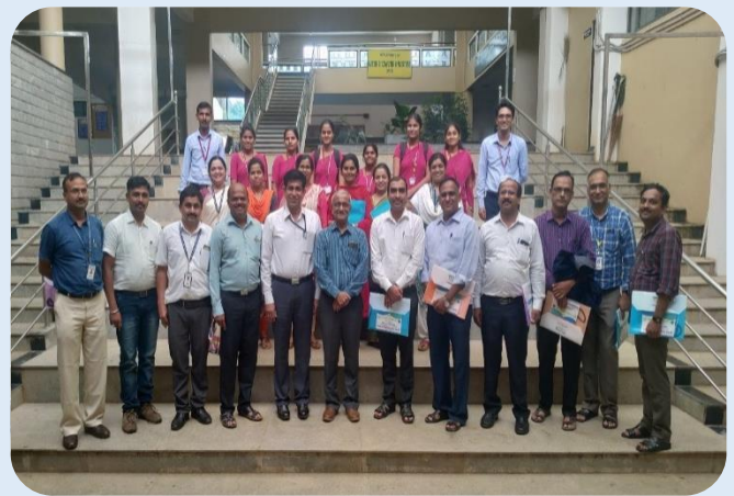
International Conference on “Marketing in Digital World: Trends, Opportunities & Challenges” 4-5 January, 2019