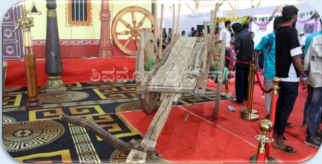
Chowki Mane in Malenadu Vaibava Stall @ NES Amrutha Mahothsava, NES Ground Shivamogga on 20-21, June,02023